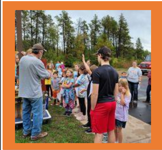
63 children & adults attended the library’s “Campfire Safety” program on September 30. Children learned about firetrucks from a Bass Lake fireman, saw a demonstration and learned how to build a fire from a retired forester, and got to see how a fire hose works.